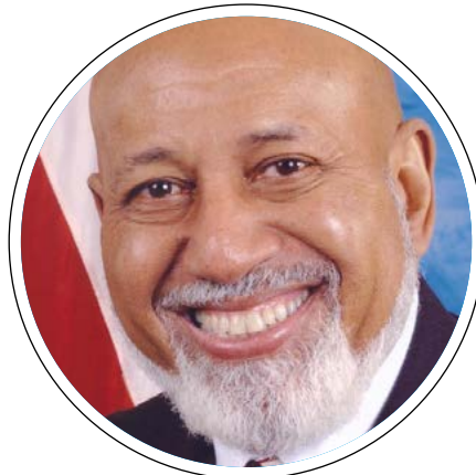
Rep. Alcee L. Hastings