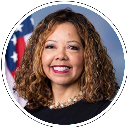
Rep. Lucy McBath