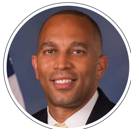
Rep. Hakeem Jeffries