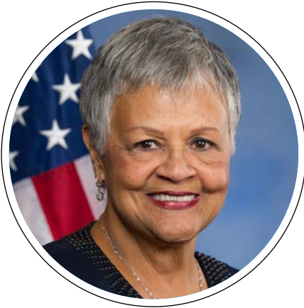
Rep. Bonnie Watson Coleman