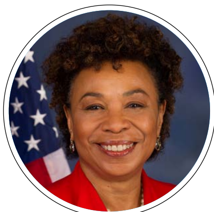
Rep. Barbara Lee