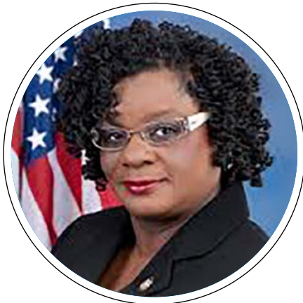
Rep. Gwen Moore