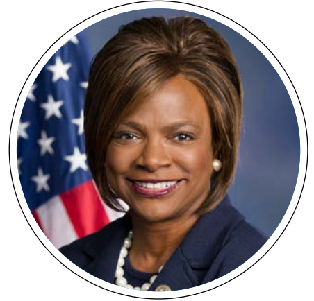
Rep. Val Butler Demings