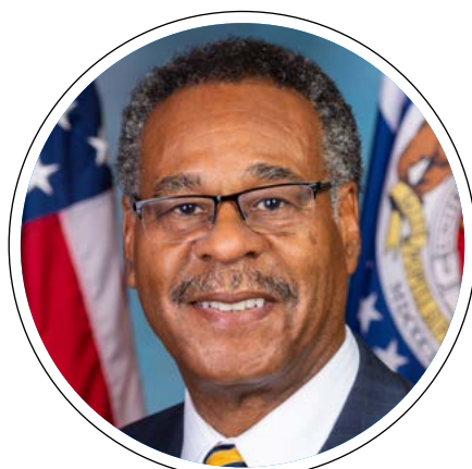
Rep. Emanuel Cleaver, II