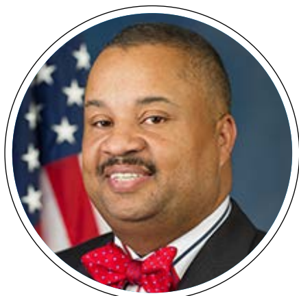
Rep. Donald M. Payne, Jr.