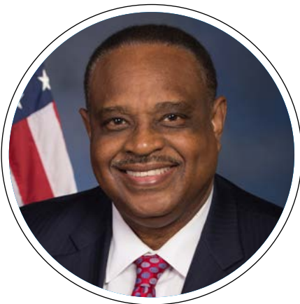
Rep. Al Lawson