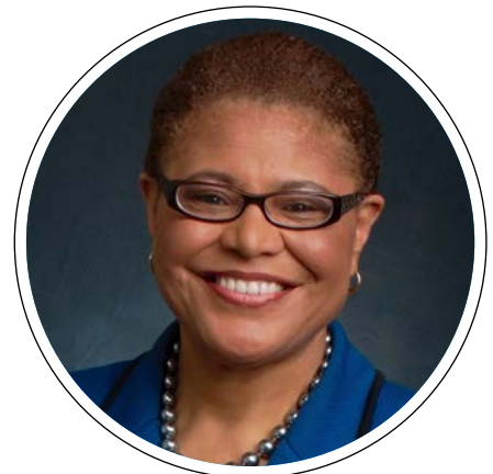
Rep. Karen Bass