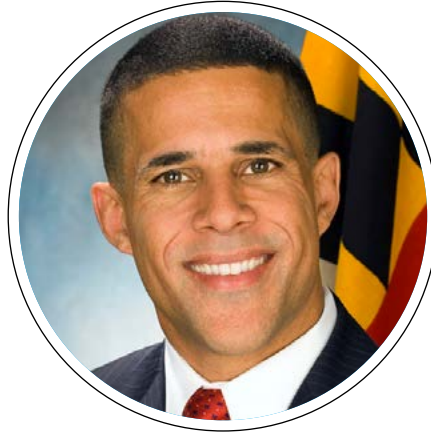
Rep. Anthony Brown