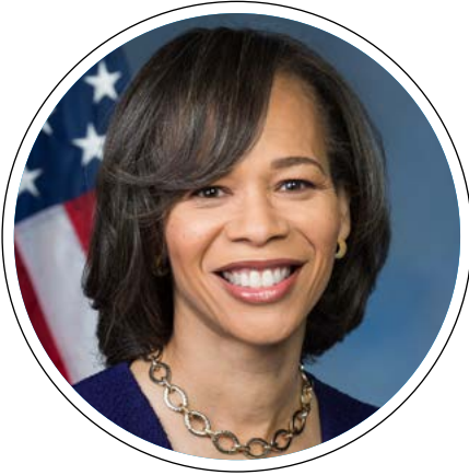
Rep. Lisa Blunt Rochester