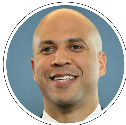
Sen. Cory Booker