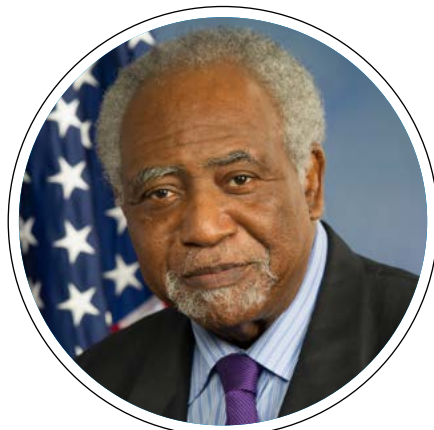
Rep. Danny K. Davis