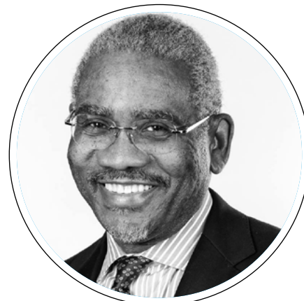
Rep. Gregory W. Meeks