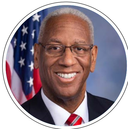
Rep. A. Donald McEachin