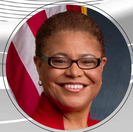
Rep. Karen Bass

The Congressional Black Caucus Foundation was established in 1976 by members of the Congressional Black Caucus. It is an American educational foundation that conducts research on issues affecting African Americans.