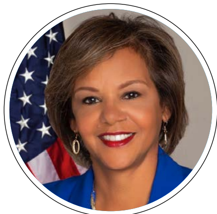
Rep. Robin Kelly