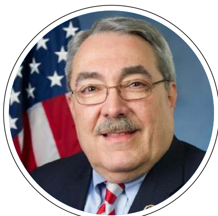
Rep. G.K. Butterfield