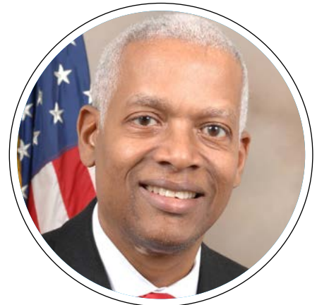
Rep. Hank Johnson