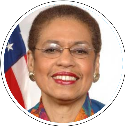
Del. Eleanor Holmes Norton