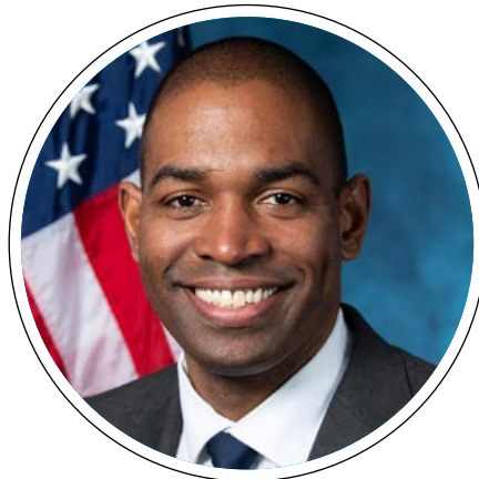
Rep. Antonio Delgado