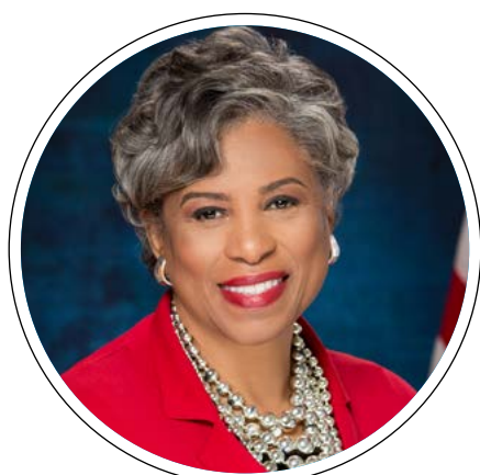
Rep. Brenda Lawrence