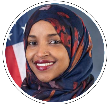
Rep. Ilhan Omar