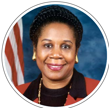
Rep. Sheila Jackson Lee