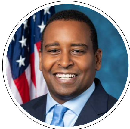
Rep. Joe Neguse