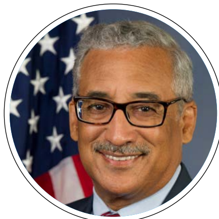
Rep. Bobby Scott