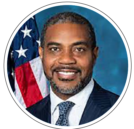
Rep. Steven Horsford