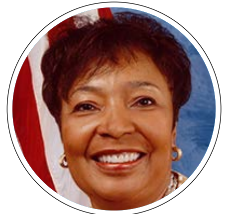
Rep. Eddie Bernice Johnson