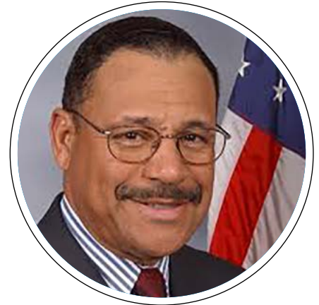
Rep. Sanford D. Bishop