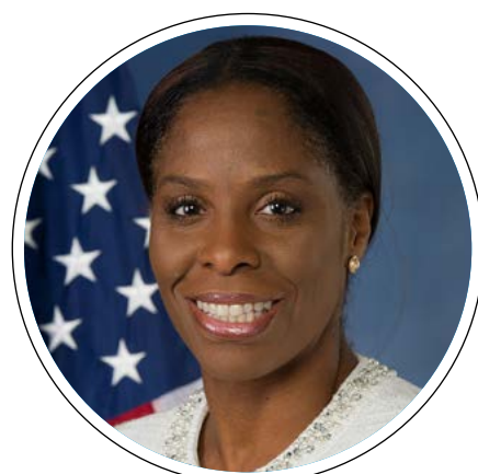
Del. Stacey Plaskett