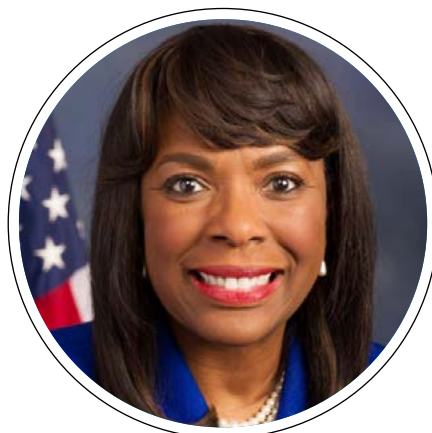
Rep. Terri Sewell