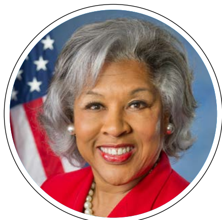
Rep. Joyce Beatty