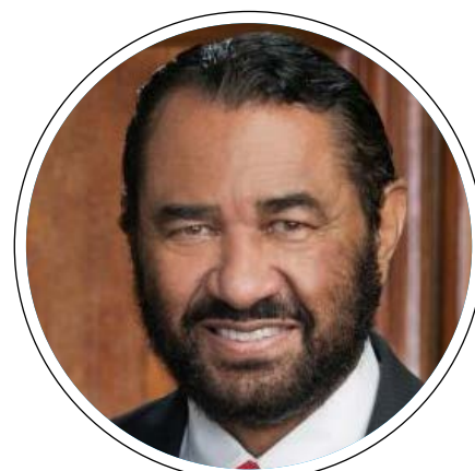
Rep. Al Green