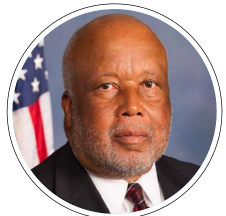
Rep. Bennie Thompson