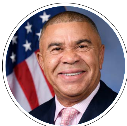
Rep. WM Lacy Clay, Jr.