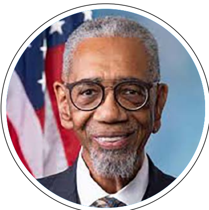
Rep. Bobby L. Rush