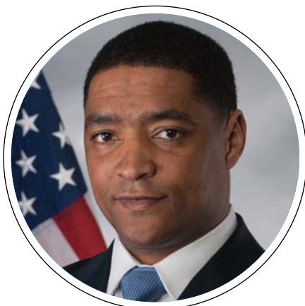
Rep. Cedric L. Richmond