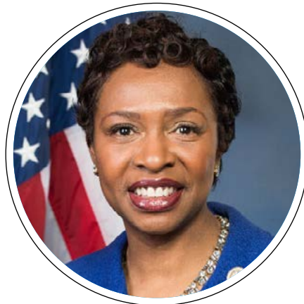
Rep. Yvette D. Clarke