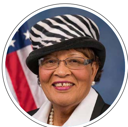
Rep. Alma Adams