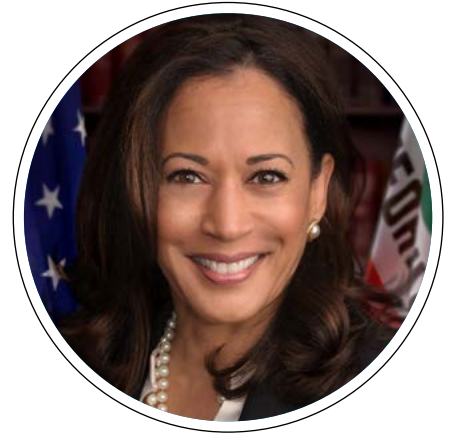
Sen. Kamala D. Harris