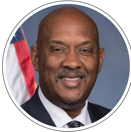
Rep. Dwight Evans