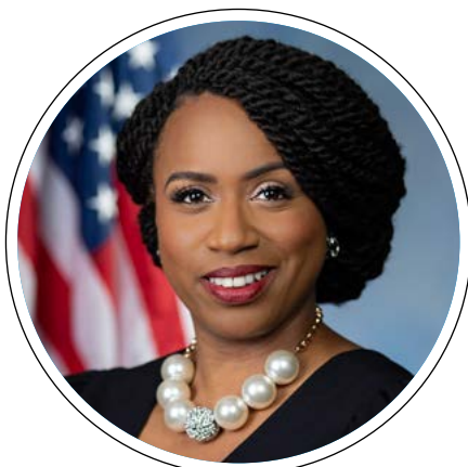
Rep. Ayanna Pressley