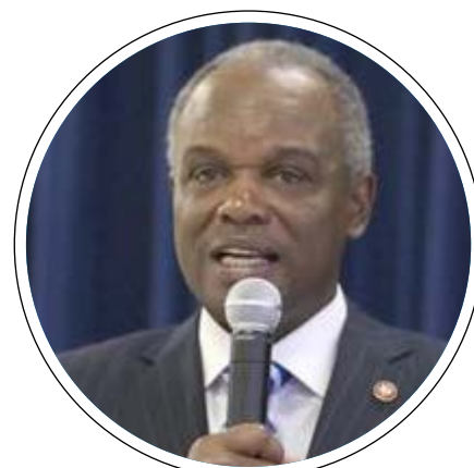
Rep. David Scott