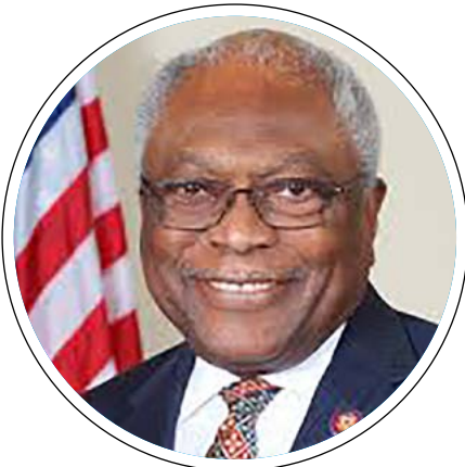
Rep. James E. Clyburn