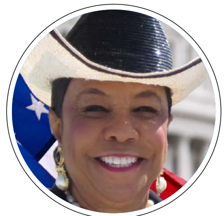
Rep. Frederica S. Wilson