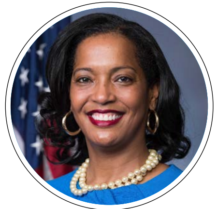
Rep. Jahana Hayes