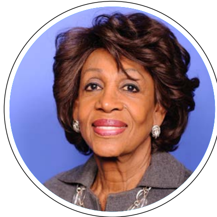
Rep. Maxine Waters