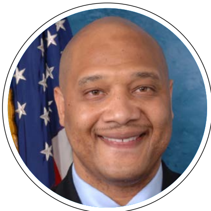
Rep. Andre Carson