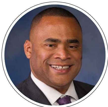
Rep. Marc Veasey