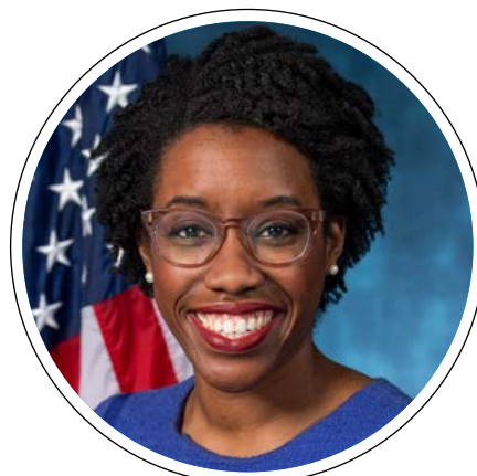
Rep. Lauren Underwood