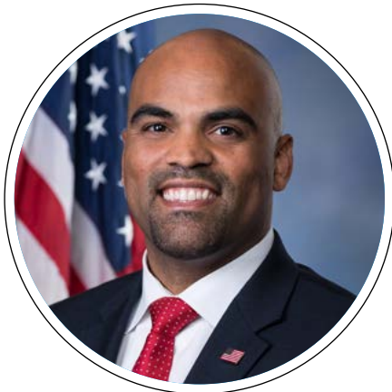
Rep. Colin Allred