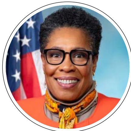
Rep. Marcia L. Fudge